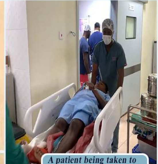
A patient being taken to the theater for the free surgical operation