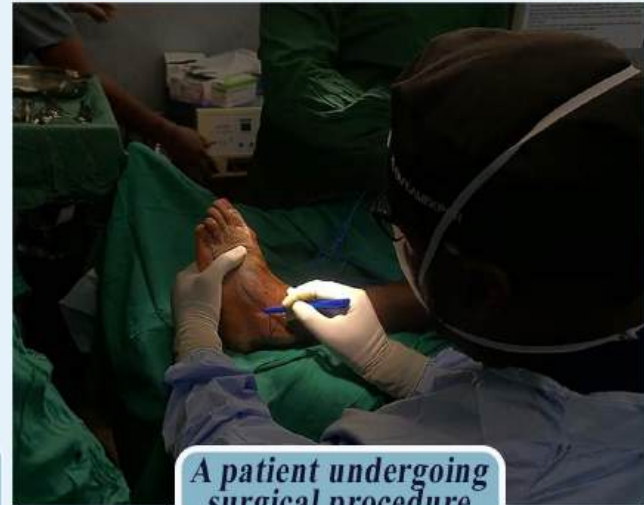
A patient undergoing surgical procedure