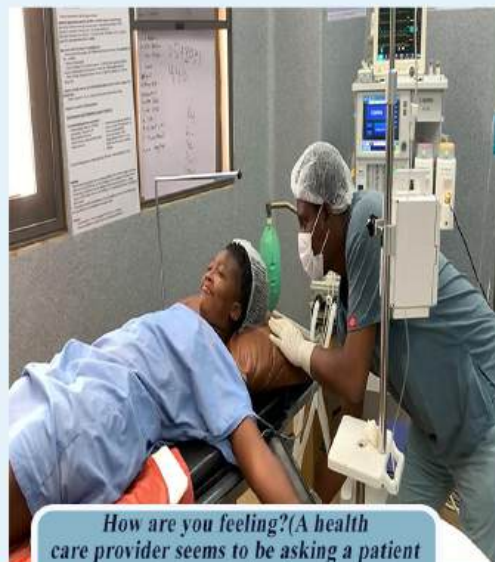
How are you feeling? (A health care provider seems to be asking a patient who went through the free surgery)